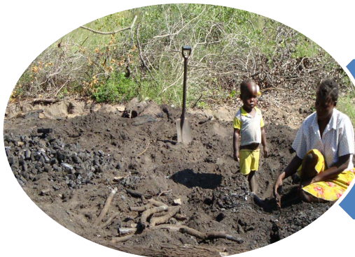
Lady with her kid at charcoal kiln