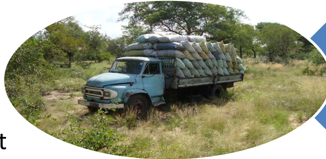
Truck overloaded with charcoal

The Government policy protect forest, encourage and support reforestation programs in degraded areas with presidential initiative “One Child One Tree One Community One New Forest”