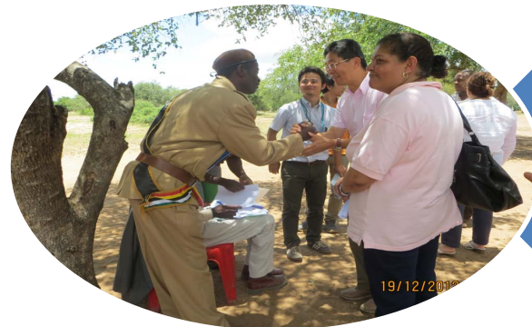
Community leaders signing MOA