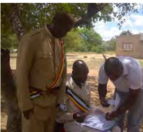
MOU signed by Community Leaders