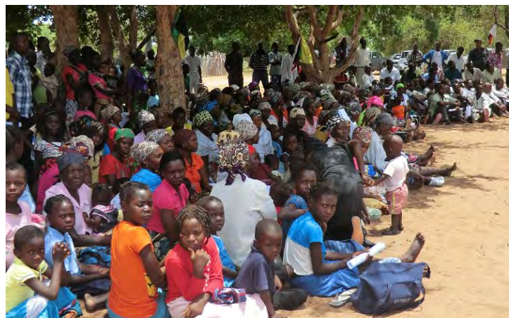
People of Nwamandzele Community