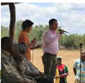
Head of Gaza SPFFB field coordination