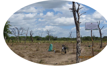
Land for Cashew Planting