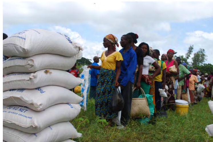
WFP Food Distribution at Camp