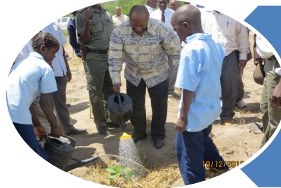
Provincial Governor planting with primary school kids.