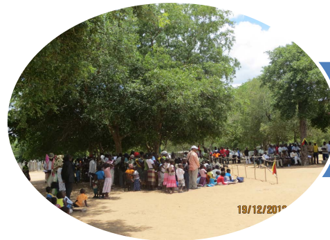
Local community in the meeting